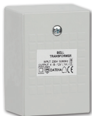
DAT01A 1A Mains Bell Transformer 4/8/12V AC