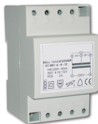
DAT03A 2A Mains Bell Transformer DIN Rail Mounted 4/8/12V AC