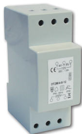
DAT02A 1A Mains Bell Transformer DIN Rail Mounted 4/8/12V AC