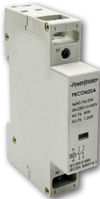
PBCON20A - 20A Contactor

Contactors are electromechanically controlled switches used to control single or multi-phase (high) power loads while the control itself can be (very) low power.