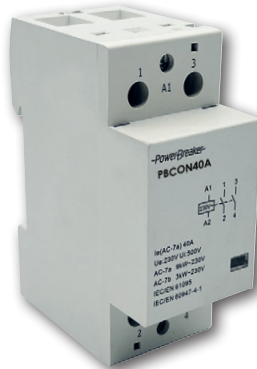
PBCON40A - 40A Contactor