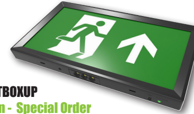
CLIFFEXITBOXUP Black Frame Option - Special Order